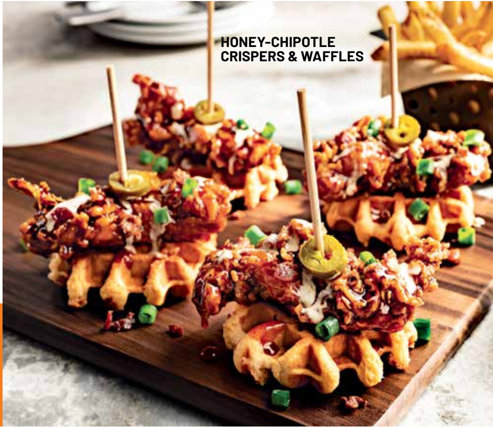
HONEY-CHIPOTLE CRISPERS & WAFFLES

Crispers on top of Belgian waffles. Topped with bacon, jalapeños, ancho-chile ranch. Served with fries & honey-chipotle sauce. 18.00