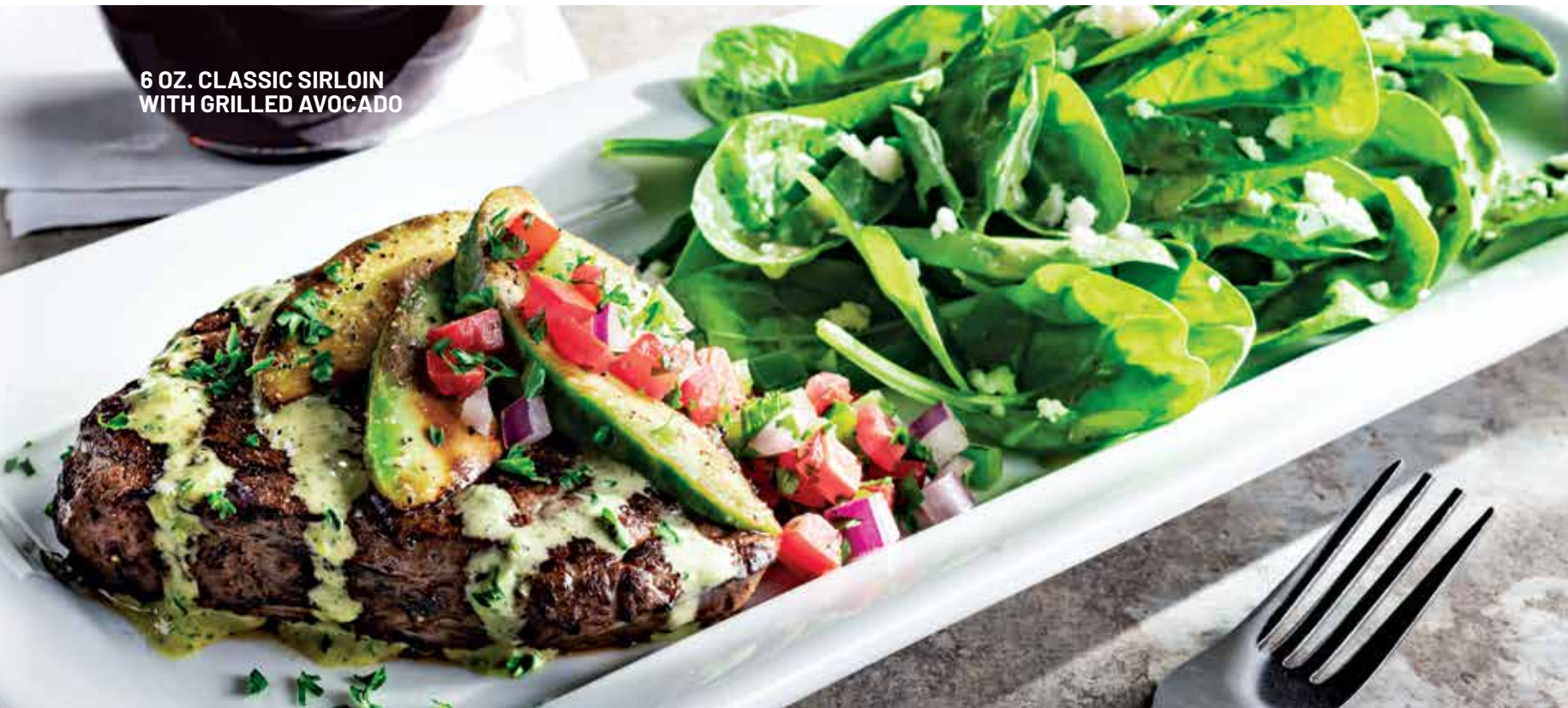
6 OZ. CLASSIC SIRLOIN WITH GRILLED AVOCADO

ADD MELTED PEPPER JACK TO YOUR STEAK +2.00