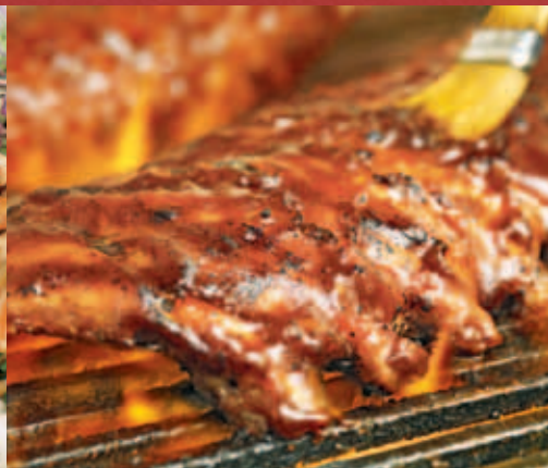
Shiner Bock® BBQ Ribs