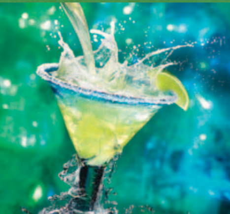
World's Freshest Margarita®