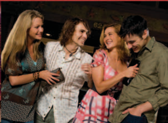
Chilli's... Like No Place Else