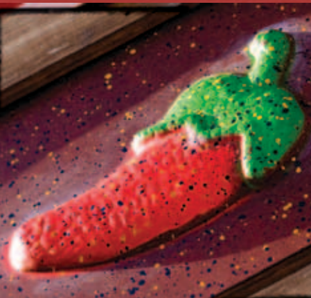
Pepper in some Flavor

The flavors are rich, ripe orchard fruit with a hint of lemon curd and baked spiced apple.