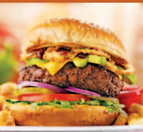
Oldtimer® Burger topped with Avocado Slices and Onion Strings

Substitute a vegetarian patty on any of our burgers. Substitute sweet potato fries for 1.99