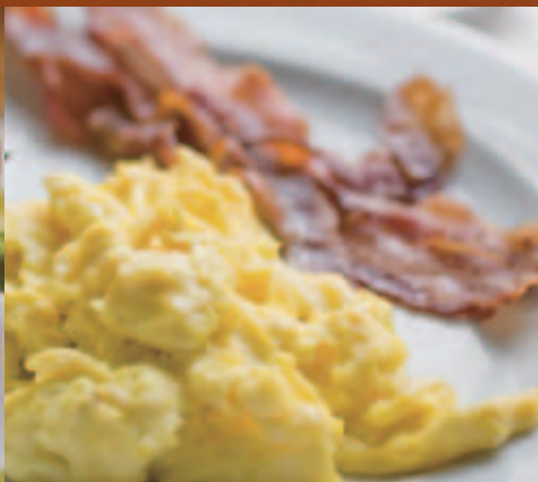
Bacon & Eggs