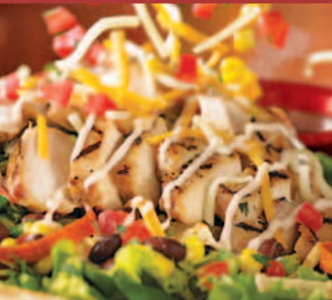
Quesadilla Explosion Salad

Try them with fresh avocado slices for .99