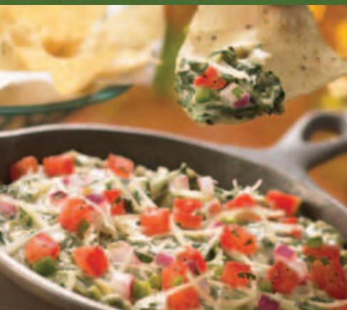
Fresh Spinach & Artichoke Dip