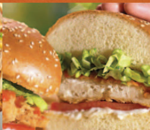
Buffalo Chicken Ranch Sandwich