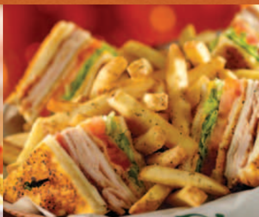
Cajun Club Sandwich