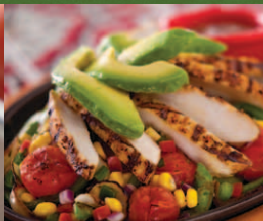
Classic Chicken Fajita