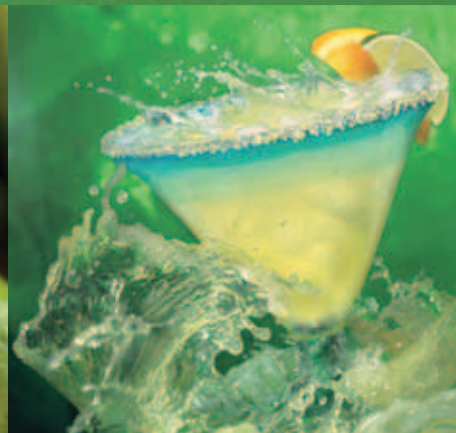
Grand Patrón Margarita®