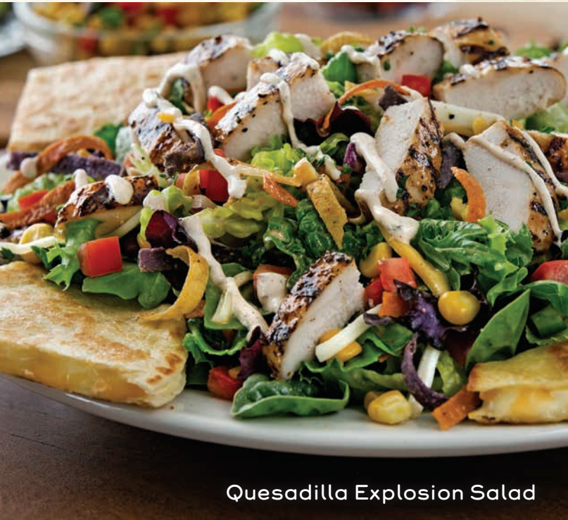
Quesadilla Explosion Salad