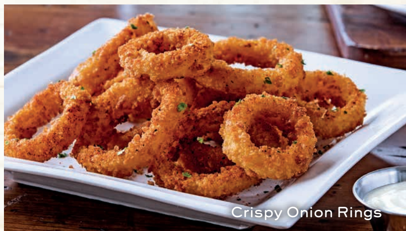
Crispy Onion Rings

Dip into these! Nothing warms up the table like our signature dips!