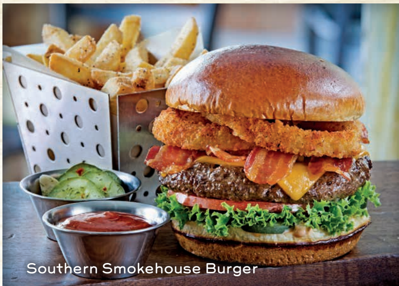
Southern Smokehouse Burger

Served with NEW house-made garlic dill pickles & homestyle fries.