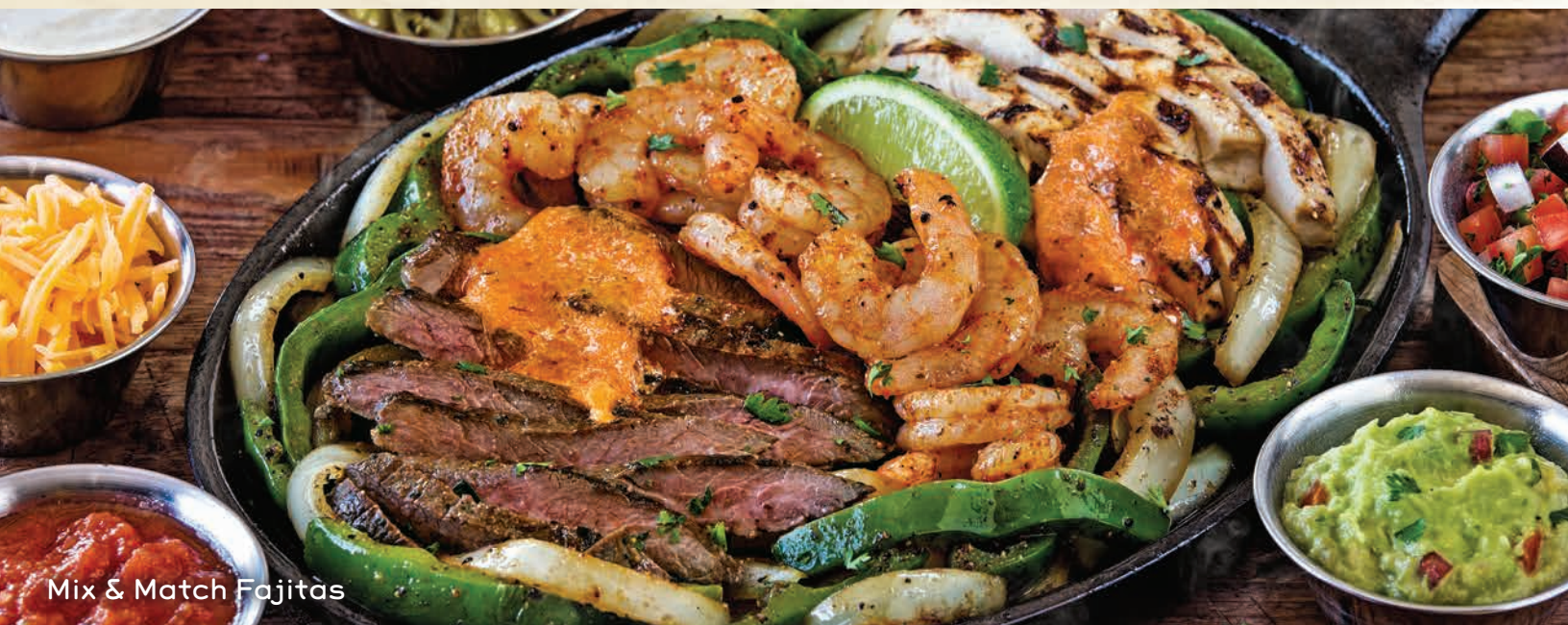
Mix & Match Fajitas