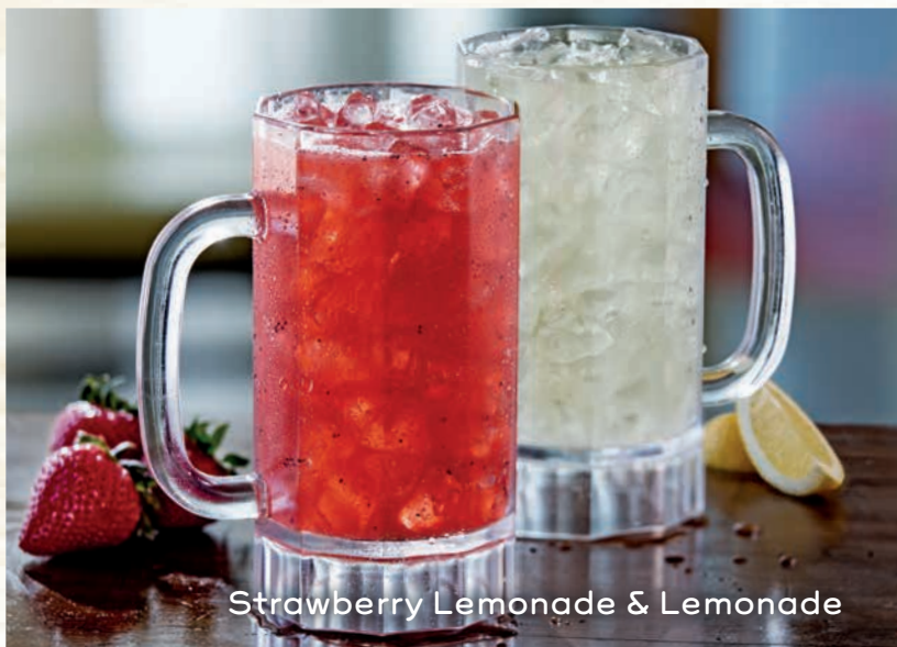
Strawberry Lemonade & Lemonade

Free refills with coffee, brewed tea, flavoured teas, lemonades & fountain drinks.