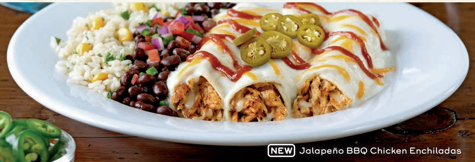
NEW Jalapeño BBQ Chicken Enchiladas

3 baked enchiladas filled with seasoned chicken & Monterey Jack. Topped with sour cream sauce, melted 3-cheese blend, chopped cilantro and house-made corn & black bean salsa. Served with citrus-chile rice & black beans. 14.49