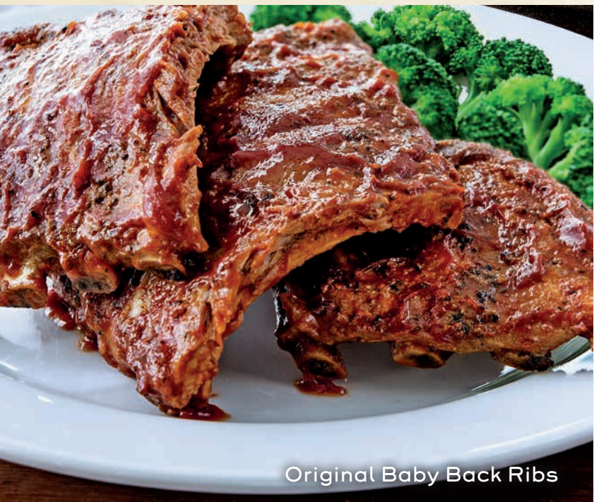
Original Baby Back Ribs

Enjoy the fall-off-the-bone goodness of our world-famous baby back ribs, slow smoked in-house over pecan wood.