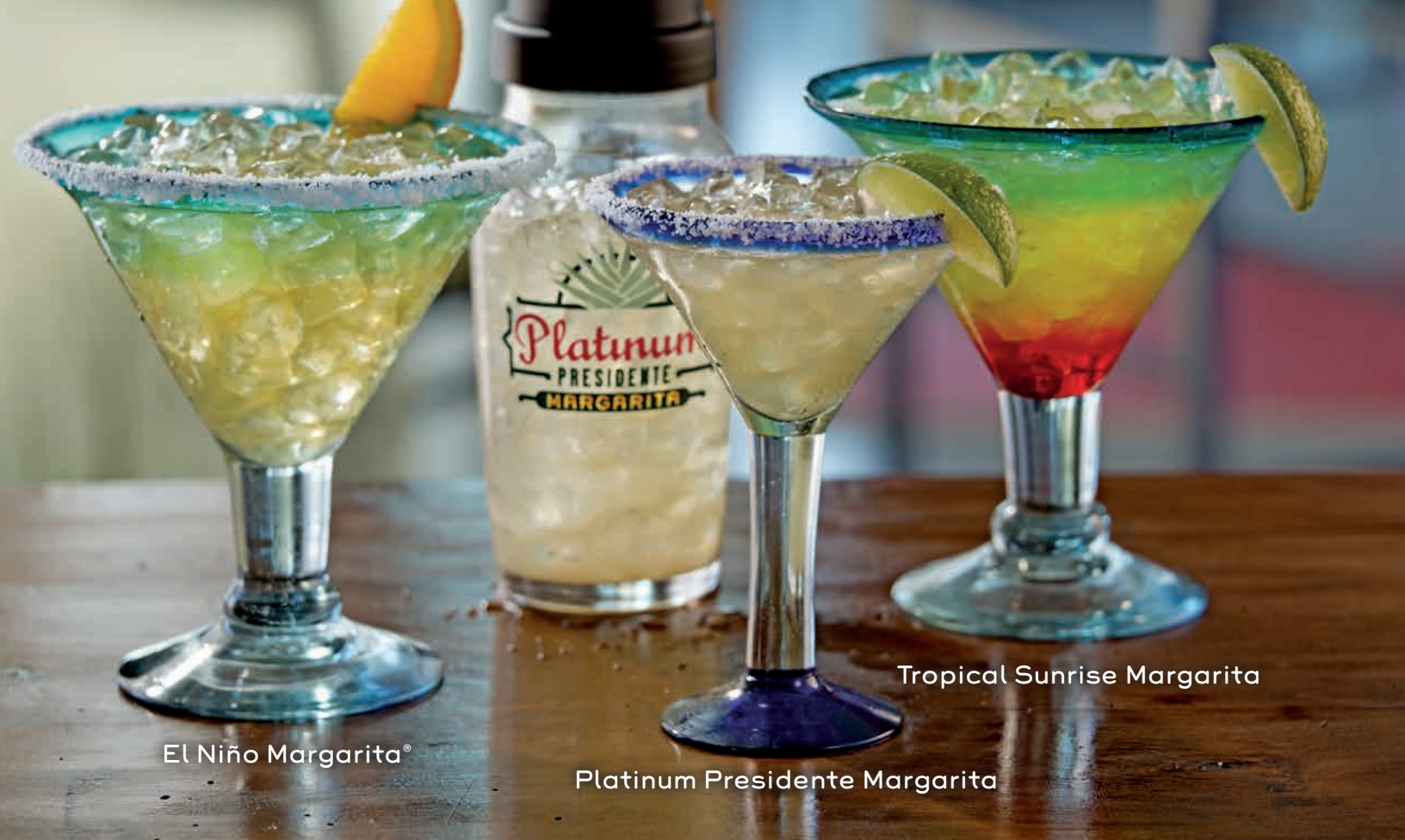
El Niño Margarita®