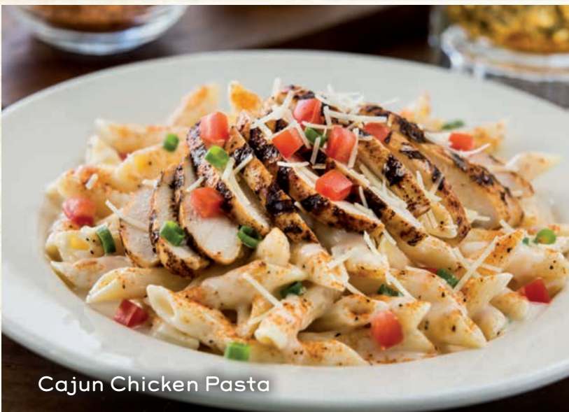
Cajun Chicken Pasta

Chile-rubbed Pacific wild caught salmon, drizzled with spicy citrus-chile sauce, topped with chopped cilantro & queso fresco. Served with citrus-chile rice & seasonal veggies. 20.99