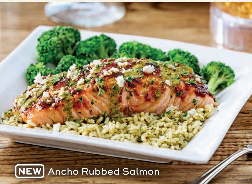
NEW Ancho Rubbed Salmon