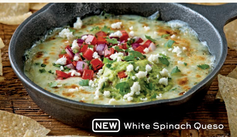
NEW White Spinach Queso