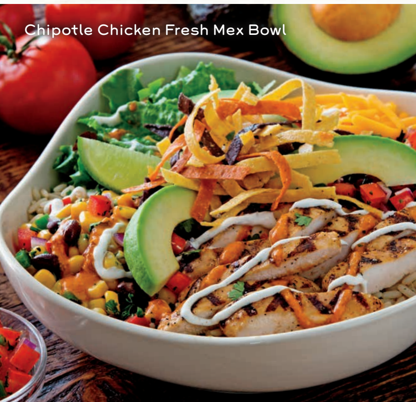
Chipotle Chicken Fresh Mex Bowl