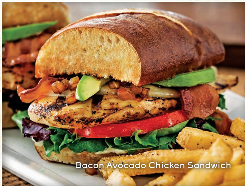
Bacon Avocado Chicken Sandwich

Crispy chicken with spicy wing sauce, tomato, fresh leaf lettuce & ranch dressing on a craft potato bun. 13.99