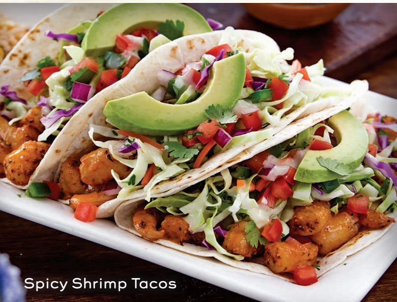
Spicy Shrimp Tacos