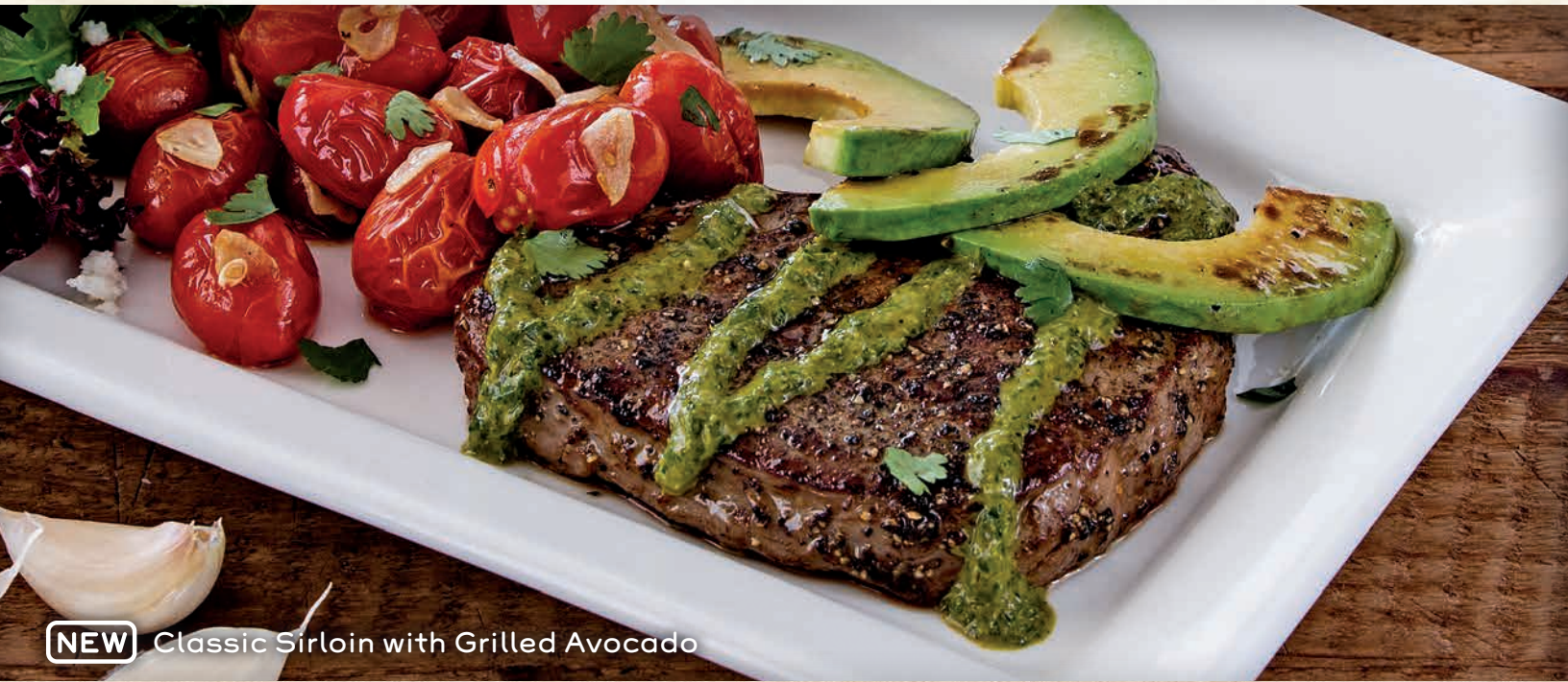
NEW Classic Sirloin with Grilled Avocado