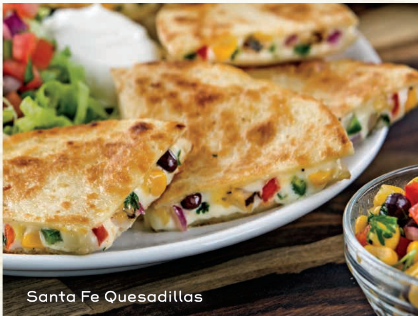
Santa Fe Quesadillas

Flour tortillas stuffed with sliced marinated chicken with house-made corn and black bean salsa, Monterey Jack & spicy Santa Fe sauce. Served with house-made pico de gallo & sour cream and your choice of homestyle fries or spicy coleslaw. 13.99