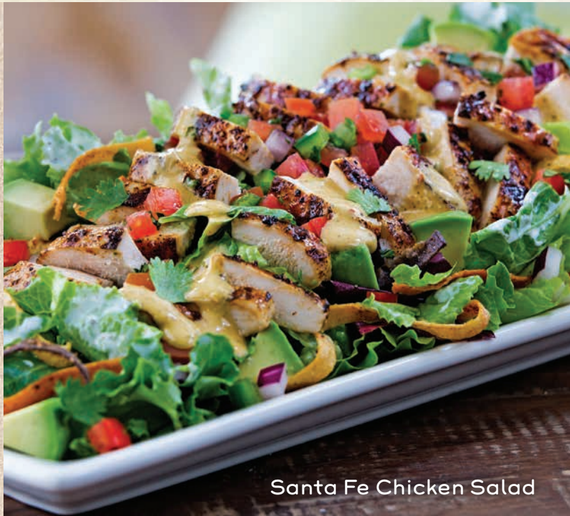
Santa Fe Chicken Salad