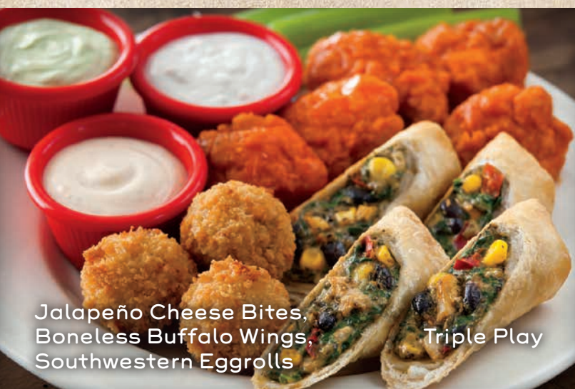
Jalapeño Cheese Bites, Boneless Buffalo Wings, Southwestern Eggrolls

Crispy Onion Rings • Southwestern Eggrolls • Crispy Chicken Crispers Boneless Buffalo Wings • Wings Over Buffalo • Jalapeño Cheese Bites