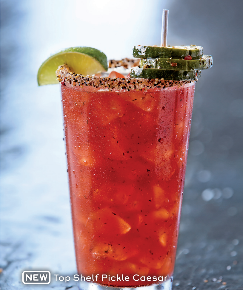
NEW Top Shelf Pickle Caesar

Maker's Mark® Kentucky Straight Bourbon, sweet vermouth & bitters mingle in this tempting cocktail. 8.49