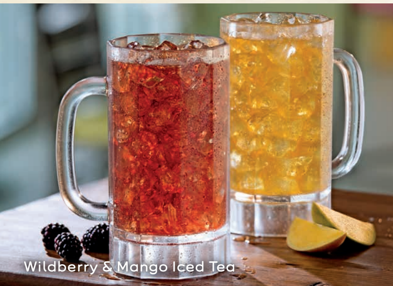
Wildberry & Mango Iced Tea