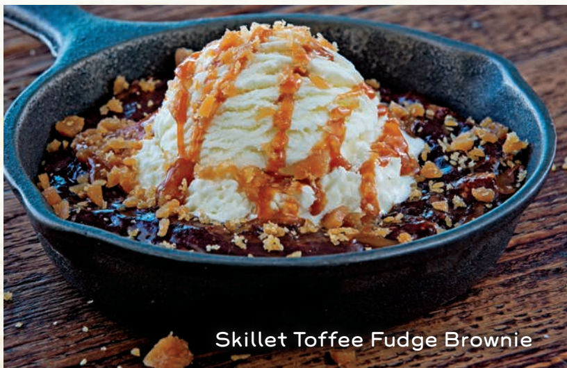
Skillet Toffee Fudge Brownie