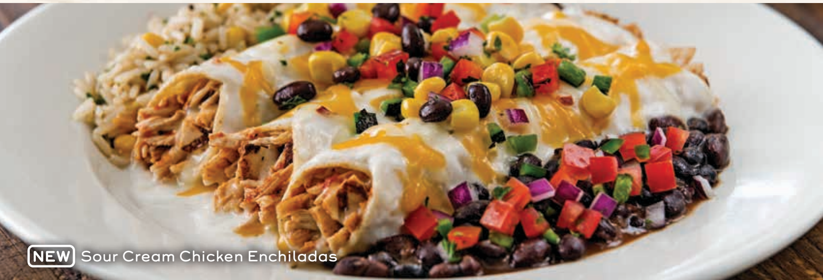
NEW Sour Cream Chicken Enchiladas

Three baked enchiladas filled with seasoned chicken & Monterey Jack. Topped with sour cream sauce, melted 3-cheese blend, chopped cilantro and house-made corn & black bean salsa. Served with cilantro rice & black beans. 14.49