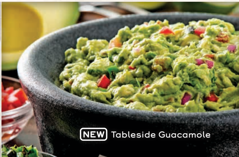
NEW Tableside Guacamole