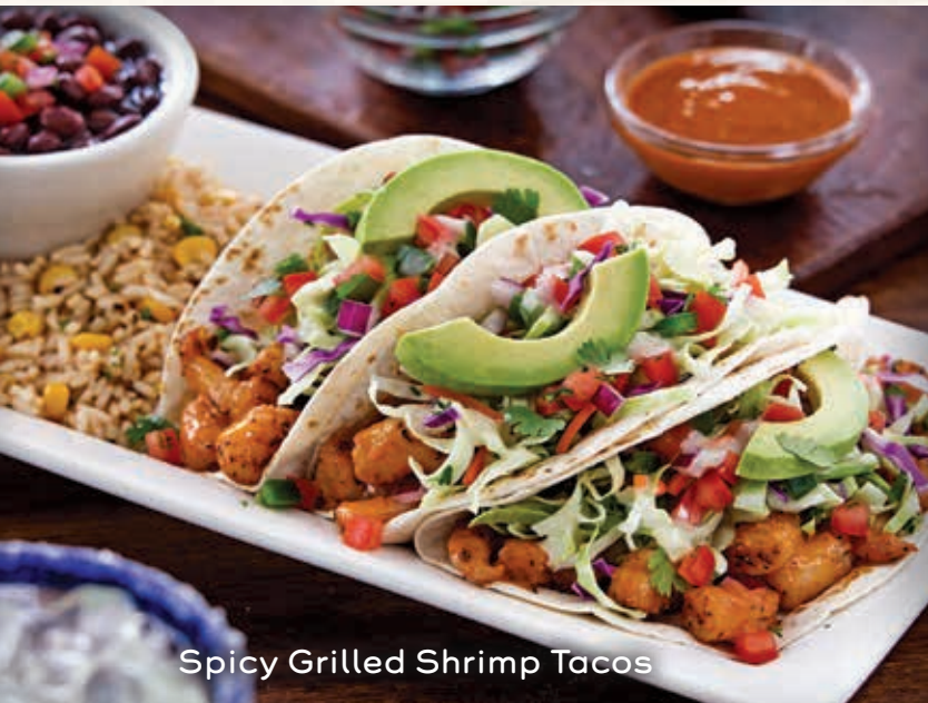
Spicy Grilled Shrimp Tacos

Flour tortillas stuffed with sliced marinated chicken with house-made corn and black bean salsa, Monterey Jack & spicy Santa Fe sauce. Served with house-made pico de gallo & sour cream and your choice of homestyle fries or spicy coleslaw. 13.99