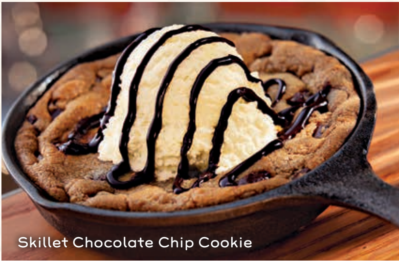
Skillet Chocolate Chip Cookie