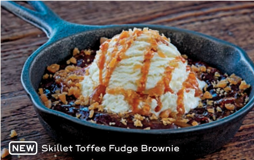
NEW Skillet Toffee Fudge Brownie