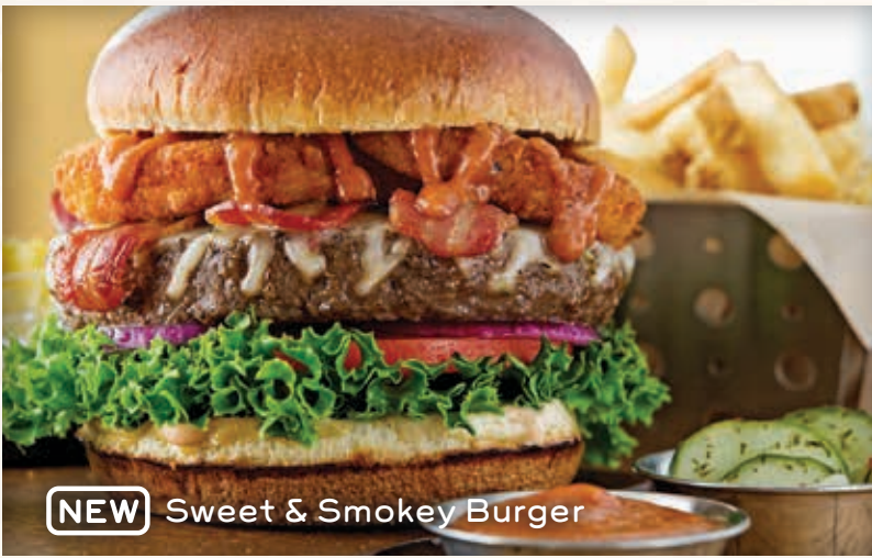
NEW Sweet & Smokey Burger