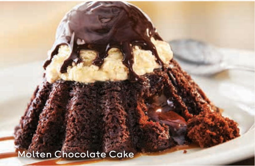
Molten Chocolate Cake

Oven-baked toffee fudge brownie topped with vanilla ice cream, drizzled with caramel sauce & topped with toffee pieces. 7.49