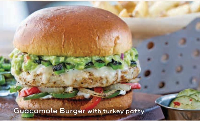
Guacamole Burger with turkey patty

Grilled chicken breast topped with applewood smoked bacon, jalapeño Jack cheese, avocado slices, sautéed onions, lettuce mix, tomato & cilantro-pesto mayo on a toasted pretzel roll. 14.99