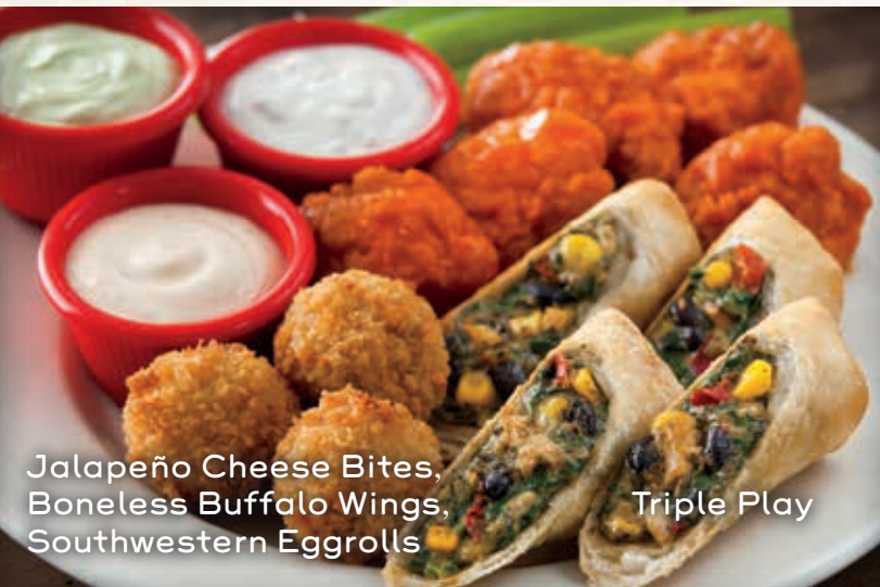
Jalapeño Cheese Bites, Boneless Buffalo Wings, Southwestern Eggrolls

NEW Crispy Onion Rings • Southwestern Eggrolls • Crispy Chicken Crispers Boneless Buffalo Wings • Wings Over Buffalo • Jalapeño Cheese Bites