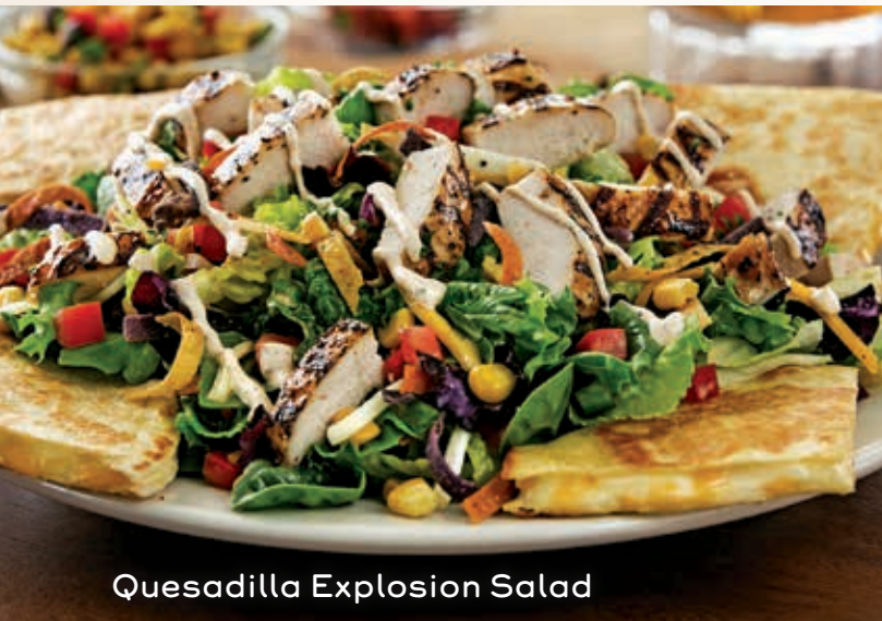
Quesadilla Explosion Salad