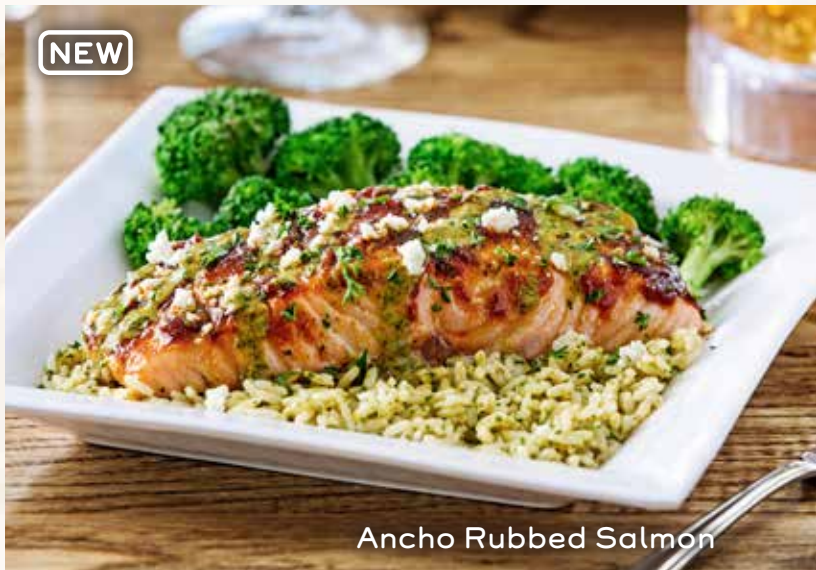
Ancho Rubbed Salmon