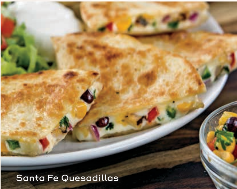
Santa Fe Quesadillas