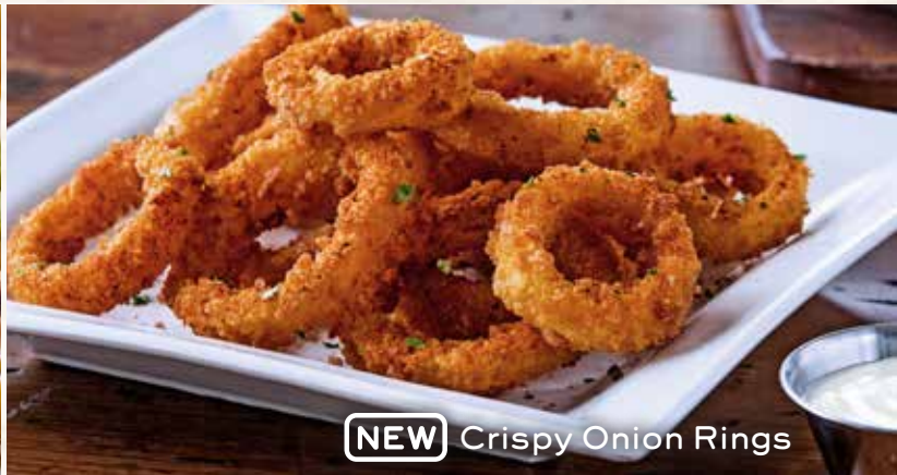
NEW Crispy Onion Rings

Dip into these! Nothing warms up the table like our signature dips!