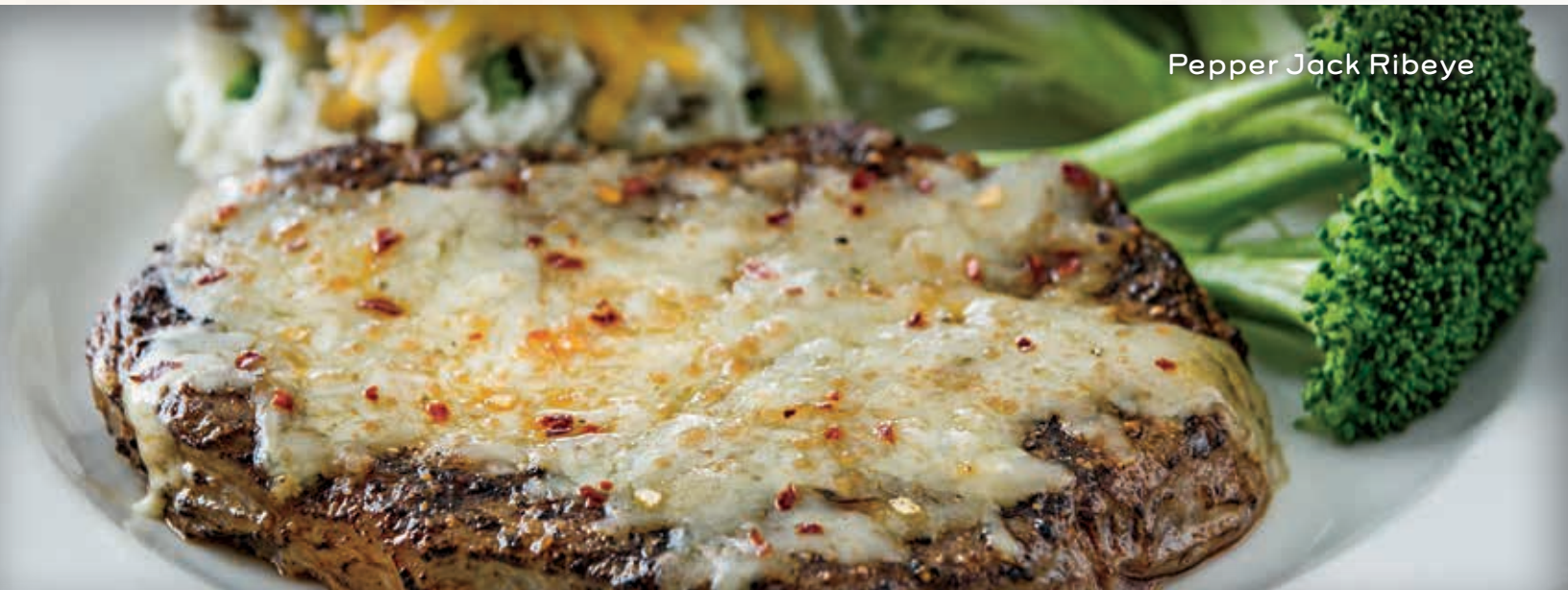
Pepper Jack Ribeye

Enjoy the fall-off-the-bone goodness of our world-famous baby back ribs slow smoked over pecan wood. With spicy coleslaw & homestyle fries. 20.99