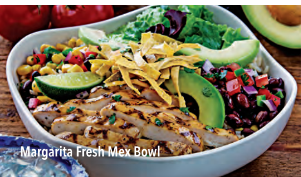
Margarita Fresh Mex Bowl

Flour tortillas stuffed with chicken, mixed cheese, chile spices, applewood smoked bacon & house-made ranch. Served with house-made pico de gallo, sour cream & ancho-chile ranch. 14.50