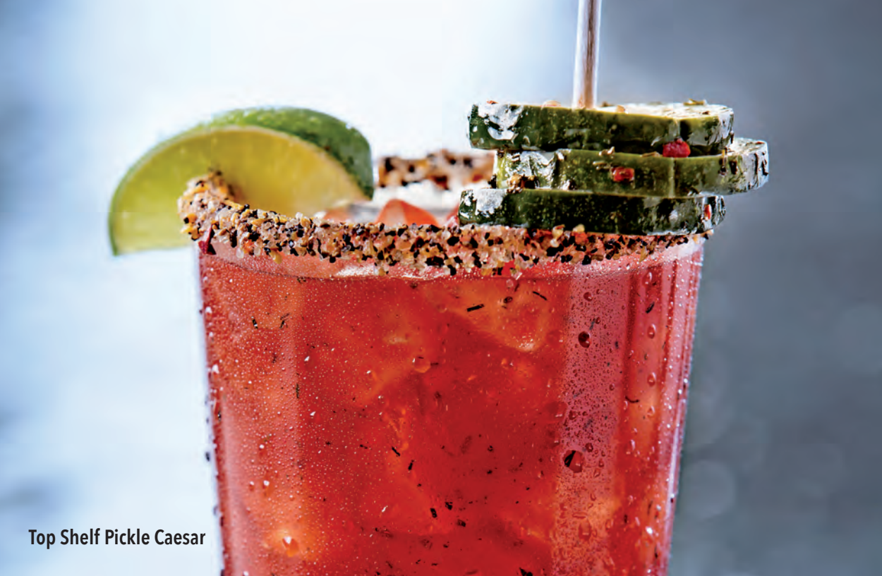
Top Shelf Pickle Caesar