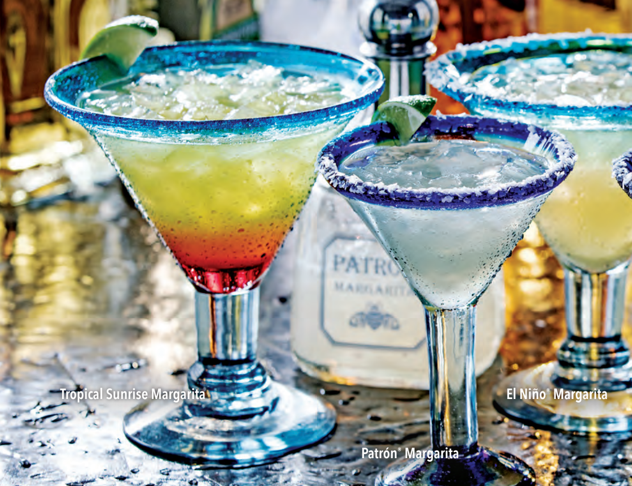
Tropical Sunrise Margarita