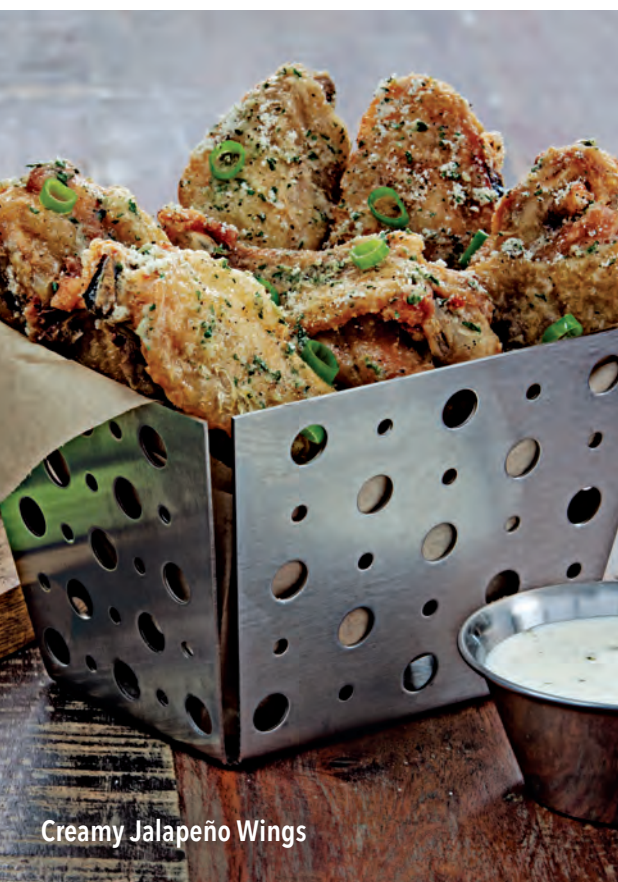
Creamy Jalapeño Wings