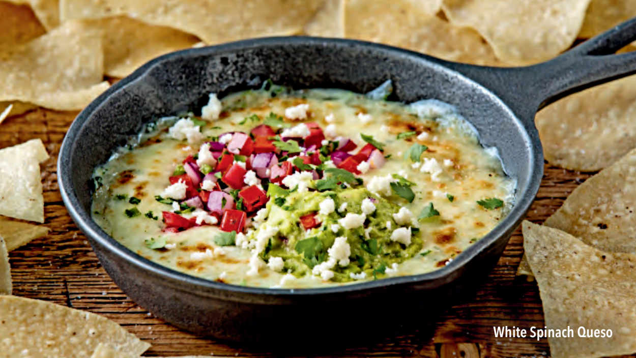
White Spinach Queso