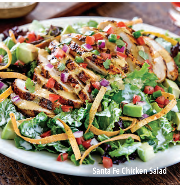
Santa Fe Chicken Salad