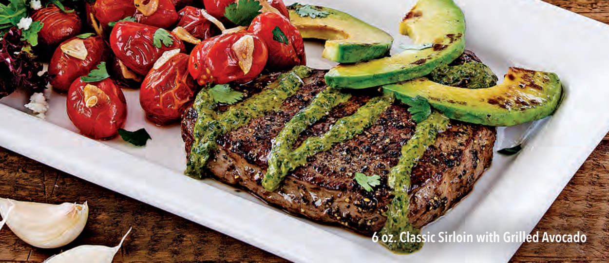
6 oz. Classic Sirloin with Grilled Avocado