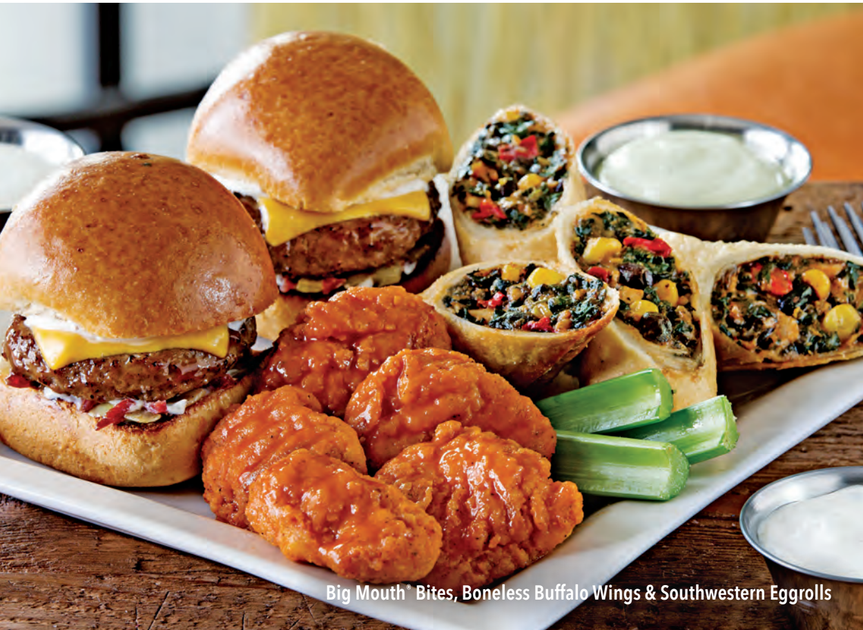
Big Mouth® Bites, Boneless Buffalo Wings & Southwestern Eggrolls

Made fresh daily with avocados, chopped cilantro, diced tomatoes, red onion & jalapeños. Served with warm tostada chips. 8.99