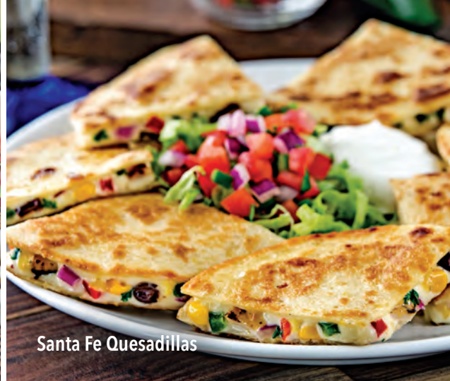
Santa Fe Quesadillas