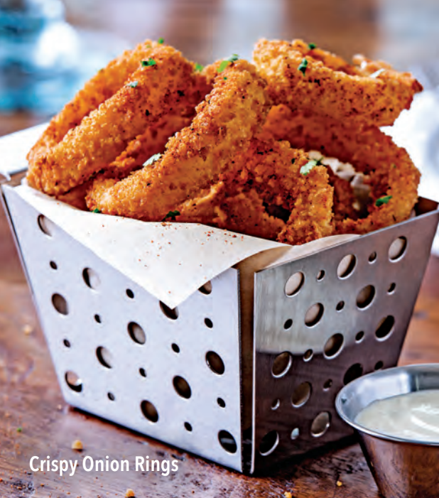
Crispy Onion Rings