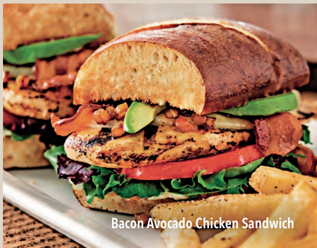
Bacon Avocado Chicken Sandwich

Crispy chicken with spicy Buffalo sauce, sliced tomato, lettuce & house-made ranch. 14.50