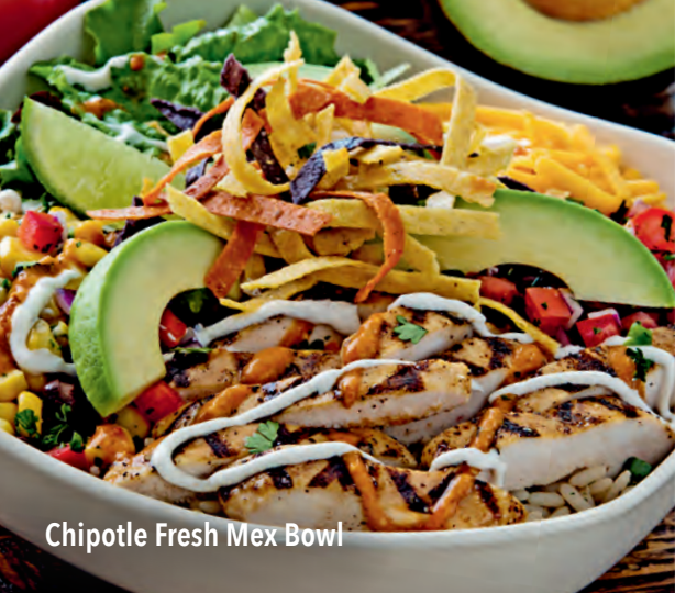
Chipotle Fresh Mex Bowl