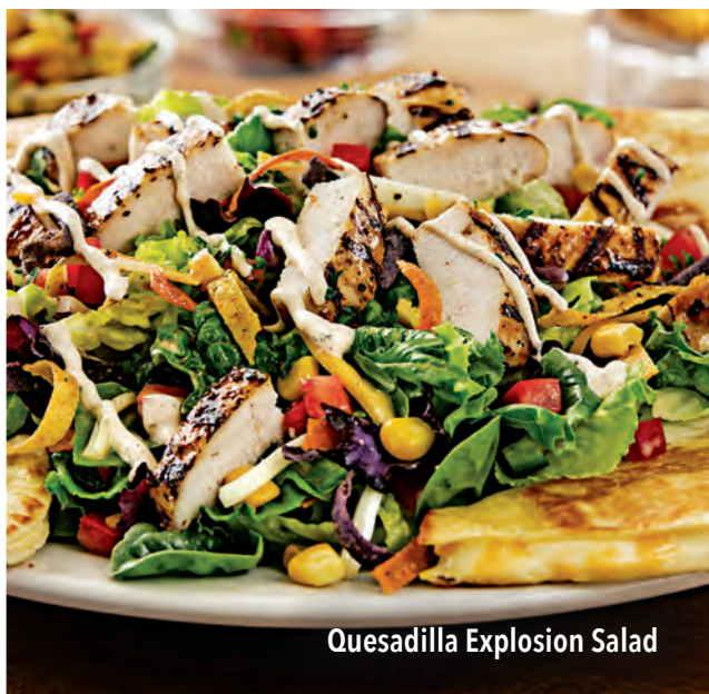
Quesadilla Explosion Salad