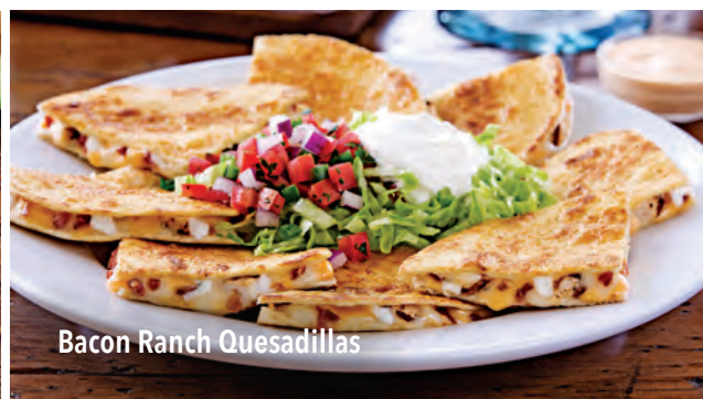
Bacon Ranch Quesadillas