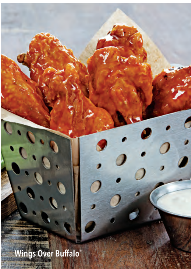
Wings Over Buffalo®