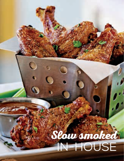
Slow smoked IN HOUSE