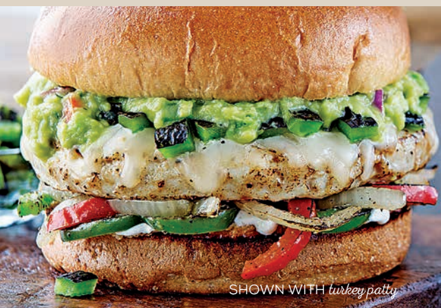
SHOWN WITH turkey patty